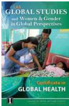
Certificate in Global Health