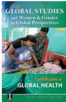
Certificate in Global Health