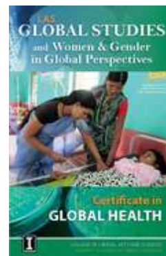
Certificate in Global Health

Please, click here to learn more about the Undergraduate Certificate