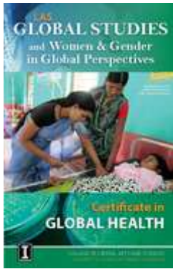
Certificate in Global Health

LAS Global Studies, in conjunction with Women and Gender in Global Perspectives (WGGP), is offering a Certificate in Global Health. This certificate is open to all undergraduate majors at the University of Illinois at Urbana-Champaign.