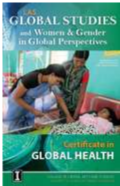
Certificate in Global Health