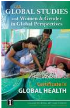
Certificate in Global Health