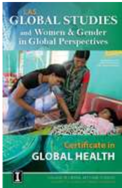
Certificate in Global Health