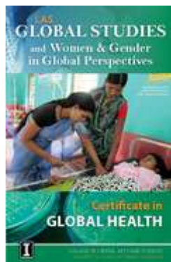
Certificate in Global Health