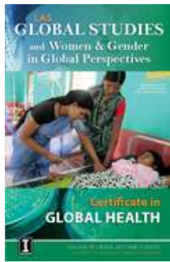
Certificate in Global Health