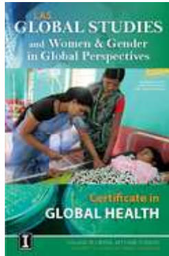
Certificate in Global Health