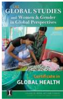
Certificate in Global Health

LAS Global Studies, in conjunction with Women and Gender in Global Perspectives (WGGP), is offering a Certificate in Global Health. This certificate is open to all undergraduate majors at the University of Illinois at Urbana-Champaign.