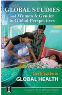
Certificate in Global Health