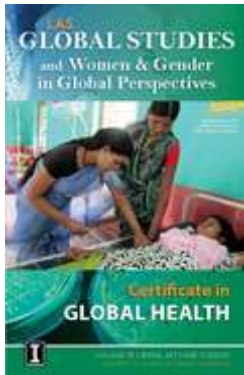
Certificate in Global Health