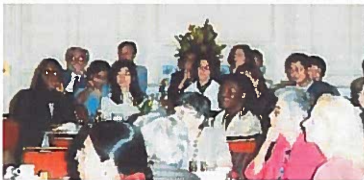
Participants in the Symposia and Anniversary Events.