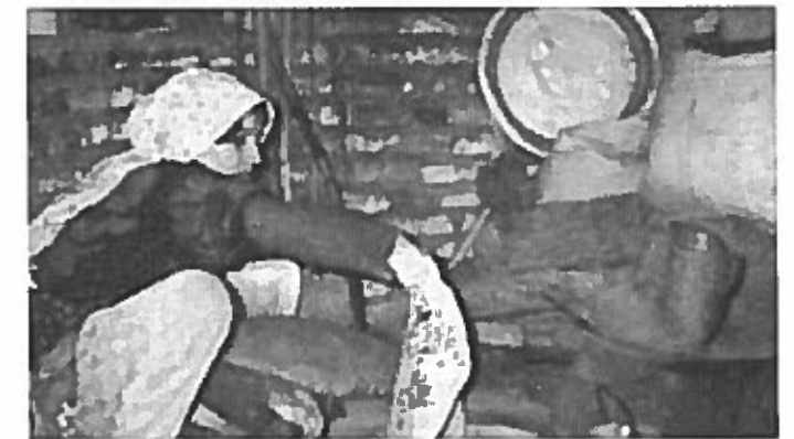
Cooking smoke can have devastating effects on poor people in developing countries.