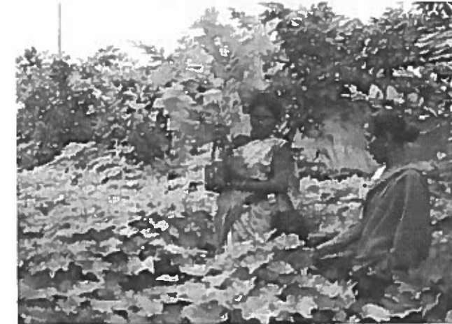
Poor tribal women raise Jatropha seedlings in Andhra Pradesh, India, earning desperately-needed cash.

This year, 2008, is expected to see the urbanized world population reach 50 percent of total population, but poverty remains more heavily concentrated in rural areas. Biofuel production and rising prices of grains could potentially help poor farmers, many of whom are women. But there are many caveats. Poor women farmers are often consumers as well as